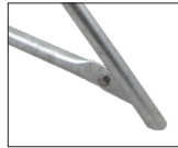
Delivered disassembled in box. Mitered end.