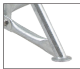
Delivered disassembled in box. Mitered end.